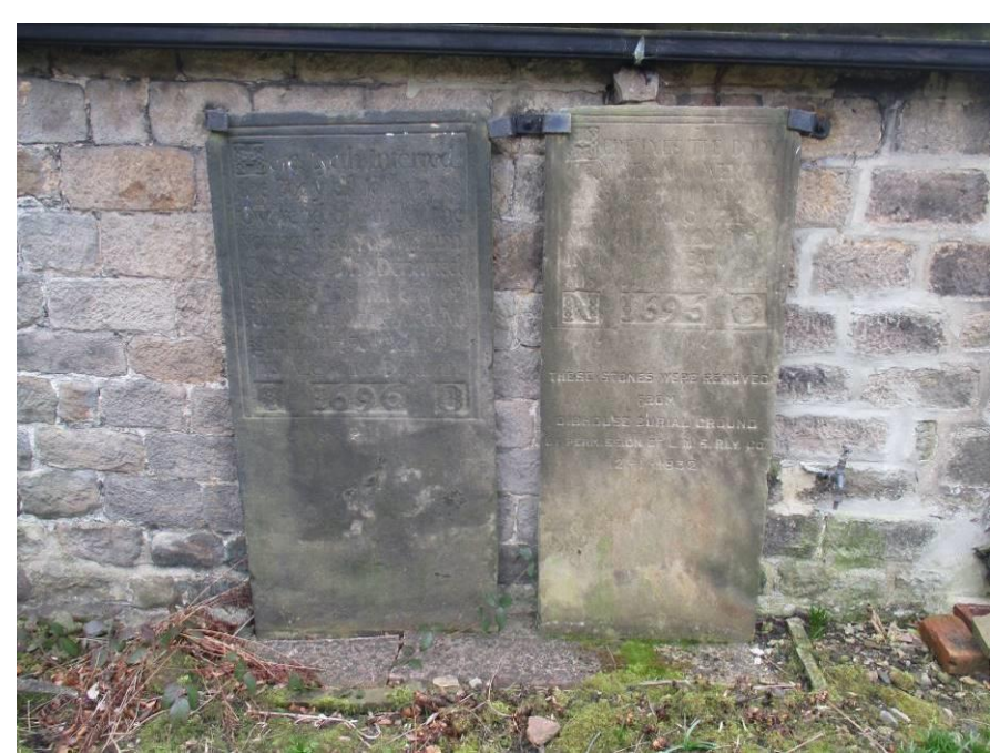
Figure 7: Two gravestones dated 1696 relocated from Dibb House Farm burial ground

The burial ground is still in use for burials and forms an L-shape to the southwest and northwest of the meeting house. It is enclosed by a dry stone wall and is well planted with mature trees and planting. The burial ground has a uniform character with rows of small round headed headstones with basic information inscribed according to Quaker tradition. Burial records are located in Brotherton Library Special Collections at the University of Leeds and cover an approximate date range from 1837 to 1988. Located on the northeast wall of the school room are two gravestones to Nathan Overend and Joshua Overend dated 1698 which were relocated from the former burial ground at Dibb House Farm.