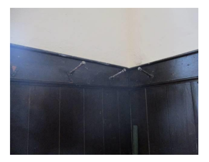
Figure 4: Hat pegs

Inside, the lobby area provides access to the small meeting room and the main meeting room. The lobby has joinery dating from the early nineteenth century including; tongue and groove panelling with turned wooden hat pegs and coat hooks, a fitted cupboard and safe to the northeast. The main meeting room retains vertically-sliding shutters to the northwest, raised Elders' stand to the southeast with the recently relocated panelled room divide in front, fixed benches to three sides, and underneath the windows to the southwest of the meeting room are Tobin tubes for ventilation. The ceiling is supported on two timber beams and lit by six pendant lights. The small meeting room to the north east corner of the meeting house has the rear exit doorway to the northeast, the walls are lined with a mixture of tongue and groove panelling, with fixed seating to the northwest. The room is divided from the lobby area by the rear of the fitted piece of furniture in the lobby and additional panelling. Similarly to the main meeting room a Tobin tube is located under the window on the northwest wall, through one of the fixed benches.