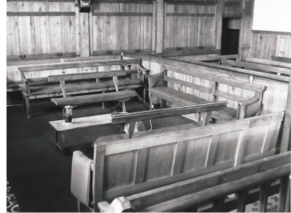
Figure 1: East side of the main meeting room, 1989 (image M160 courtesy of Aireborough Historical Society)