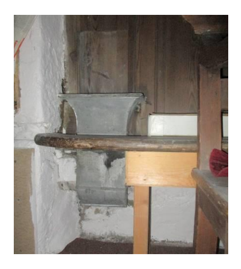
Figure 5: Tobin tube