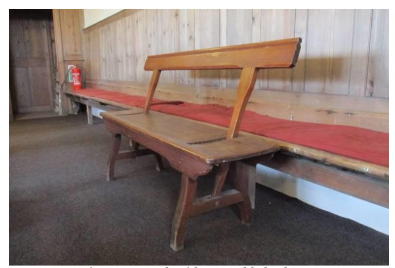
Figure 6: Bench with moveable back rest